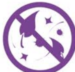
Eliminates volatile organic compounds (VOCs)