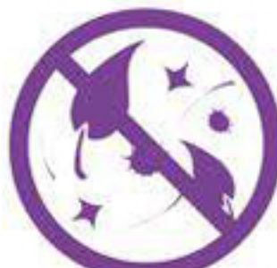
Eliminates volatile organic compounds (VOCs)