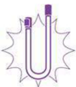
UV 'J' Lamp