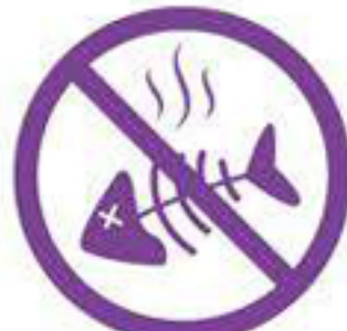
Eliminates odors and chemical contaminants