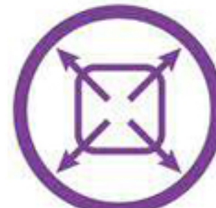
Purifies up to: 4,000 sq.ft.