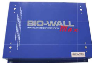
Ballast box and optional touchscreen